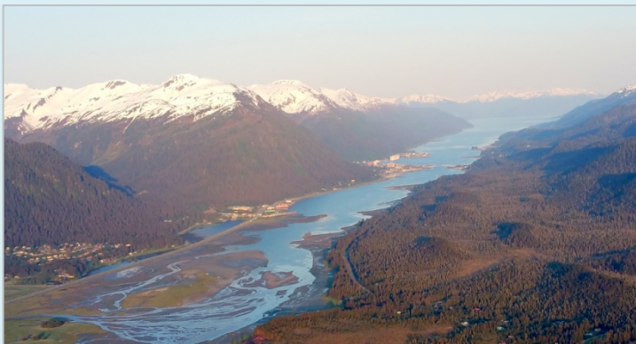
Looking at downtown Juneau from 3000' over the airport