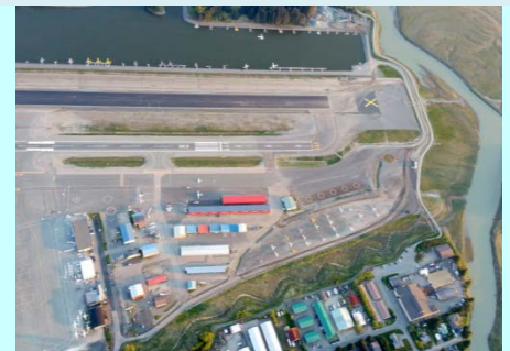
Jordan Creek crosses under the runway in a 10' x 14' pipe arch culvert

Please, RSVP: to Marc at 646-9661 or e-mail him at: mfrutiger@rmconsult.com as soon as possible so the lunches can be ordered & the room set up to accommodate everyone.